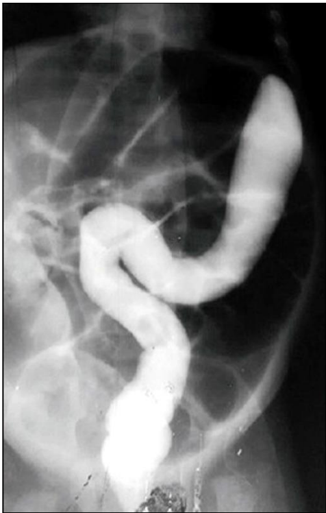
Figure 1: Barium enema showing contrast not traversing beyond the splenic flexure.

Endoscopy was done in 1 case preoperatively where we were unable to negotiate beyond splenic flexure. After preliminary resuscitation and investigations, exploratory laparotomy was done in all cases. CS (Fig. 2) was in left colon in all cases. All cases were managed by resection of the involved bowel, biopsy from distal part of the colon and stoma formation. The biopsies from distal colon were positive for ganglion cells. Full thickness rectal biopsy was done to rule out Hirschsprung Disease before closure of the stoma that revealed absence of ganglion cells. Therefore, Duhamel Pull through was done in these patients as a definitive procedure. In all underlying pathology for CS was HD. Patients have been on followed up for 2 years after definitive surgery, and all are doing well. Table 1 describes summary of the study cases.