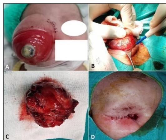
Figure 1: A) Proptosis with severe corneal melting. B) Lid sparing modified exenteration. C) Excised tumor. D) Partial lid closure done 6 weeks of first surgery.

remarkable. B-scan ultrasound of right eye showed calcifications in the vitreous. MRI showed a heterogeneous density mass in right orbital cavity, with post-contrast enhancement displacing the globe inferiorly (Fig.2). Radiological diagnosis was a complex mass with internal hemorrhage or a teratoma.