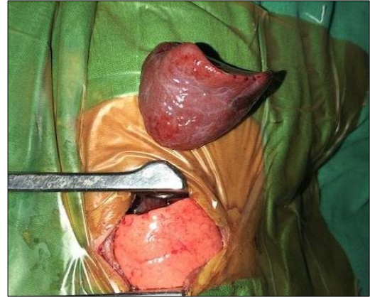
Figure 3: Excised BPS

development of NIH is most probably secondary to high-output cardiac failure due to vascular steal which may occur in the presence of an anomalous systemic artery and venous drainage via pulmonary or systemic veins.[6]