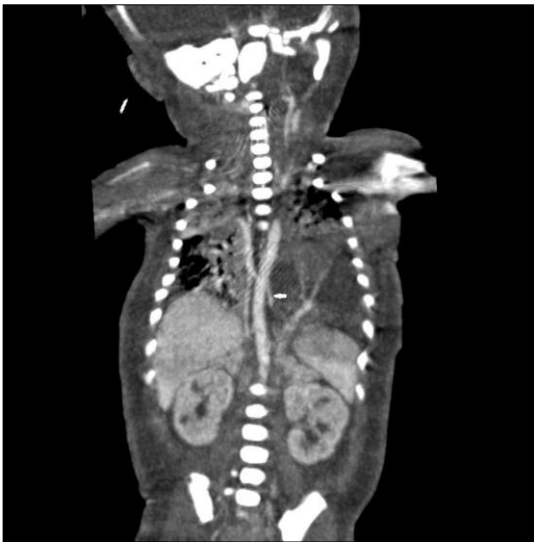
Figure 2: CT thorax showing the feeding vessel to the ELS from the aorta.

The baby developed a contralateral pleural effusion on the 2nd postoperative day, which required drainage with a right-sided intercostal drain. The drain output gradually reduced over 7-10 days after which both the ICDs were removed and the baby was discharged in good condition. The baby is doing fine on the follow-up of 6 months.