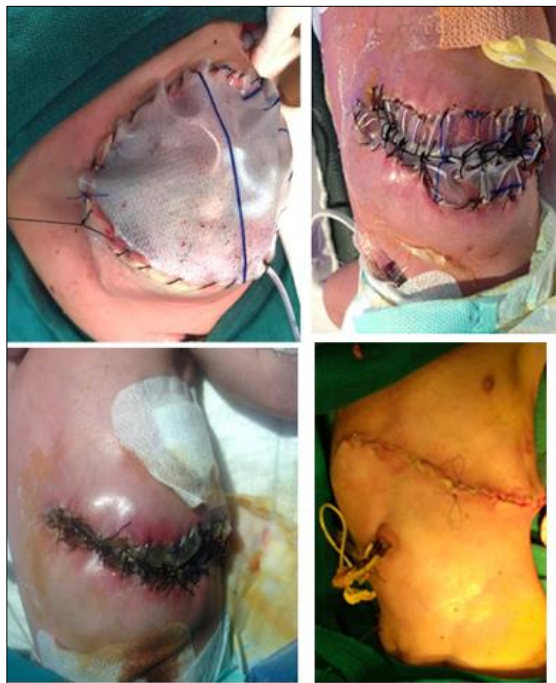
Figure 2: Bogota bag technique of closure of abdominal contents.