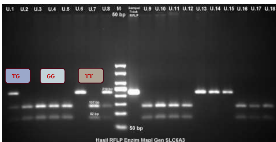
Figure 3. RFLP Results of the MspI Enzyme of the DAT1 Gene (SLC6A3) rs27072

Figure 2 shows the PCR results of the DAT1 gene (SLC6A3) at the rs27072 locus which is seen at 219 base pairs (219 bp).