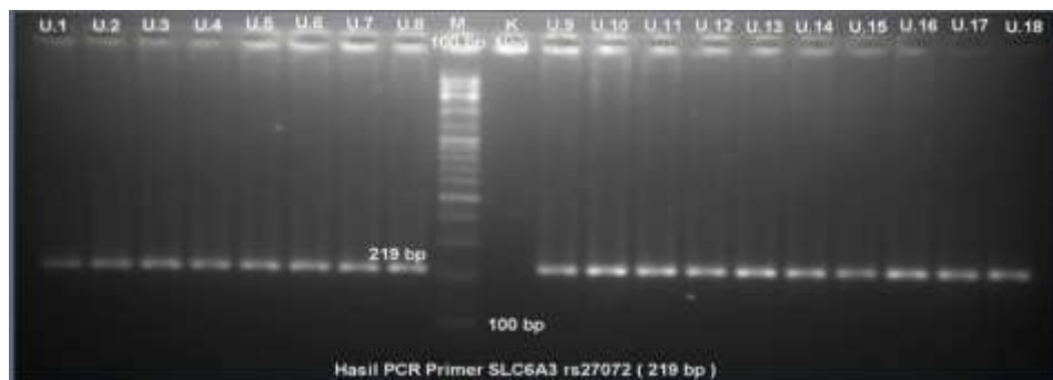
Figure 2. PCR results of DAT1 (SLC6A3) gene rs27072 (219 bp)

Figure 2 shows the PCR results of the DAT1 gene (SLC6A3) at the rs27072 locus which is seen at 219 base pairs (219 bp).