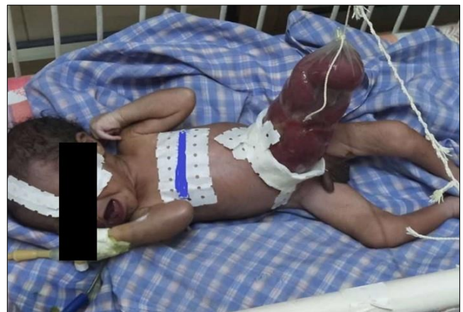
Figure 1: Female condom used as a silo.

After gentle cleaning of the intestines with warm normal saline, the eviscerated intestines were covered initially with saline-soaked dressing; followed by either primary reduction and closure of the defect or placement of eviscerated bowel in a feminidom (female condom) (Fig.1) or Alexis wound retractor (Fig.2) was used to initiate a gradual reduction of the intestines into the abdomen. After complete reduction of these loops intra-abdominally, the para-umbilical defect is closed.